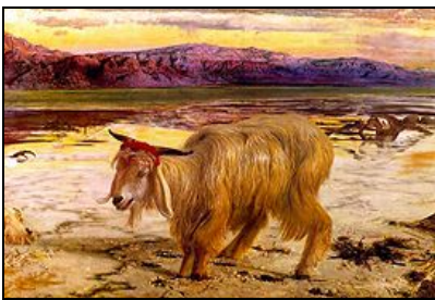
The Scapegoat by William Holman Hunt .